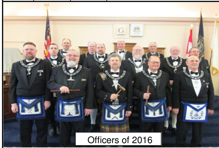
Officers of 2016